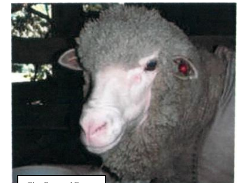
Fine Featured Ewes