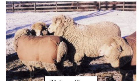
Wethers and Rams