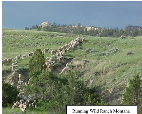
Running Wild Ranch Montana

Contact your local Cormo breeder or the association for more information.