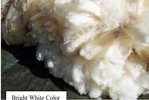
Bright White Color