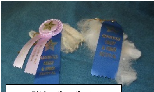
2014 First and Reserve Champion Kentucky Sheep and Fiber Festival – Alyce Grover